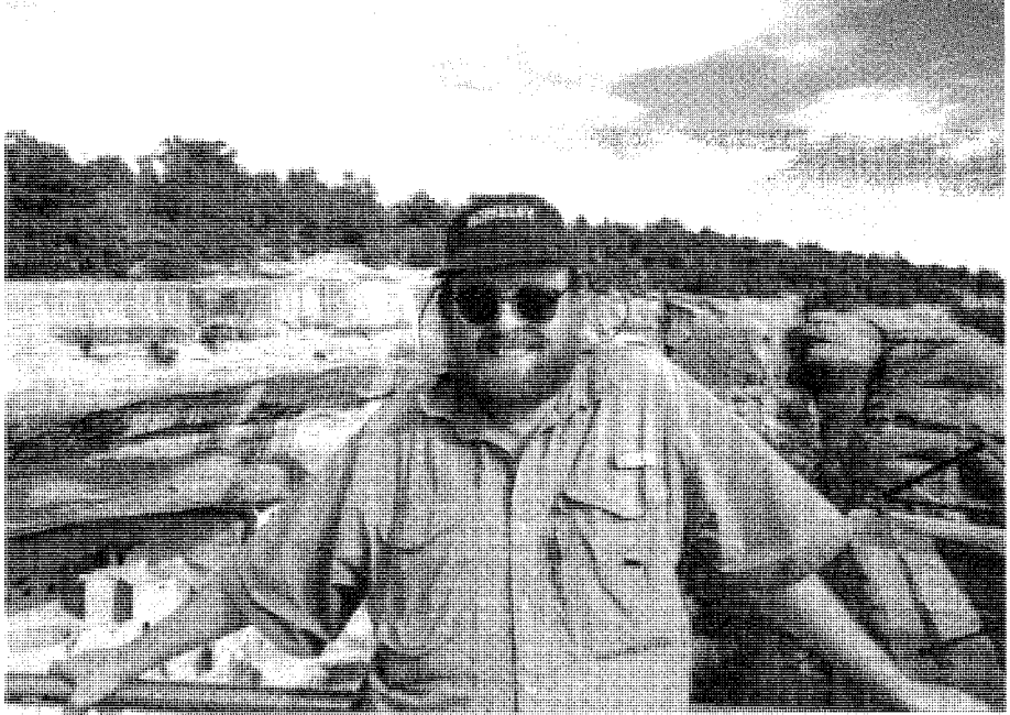
Mesa Verde, Summer 1997